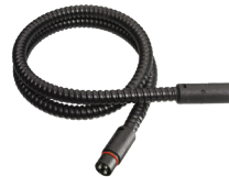
PlugIn extension cables