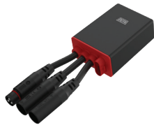
MultiCharger 1205R Flex