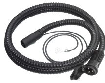
PlugIn inlet cable