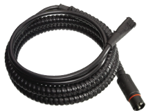
Termini™ extension cable