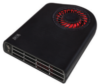
Termini™ II 1900