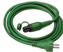
MiniPlug connection cable